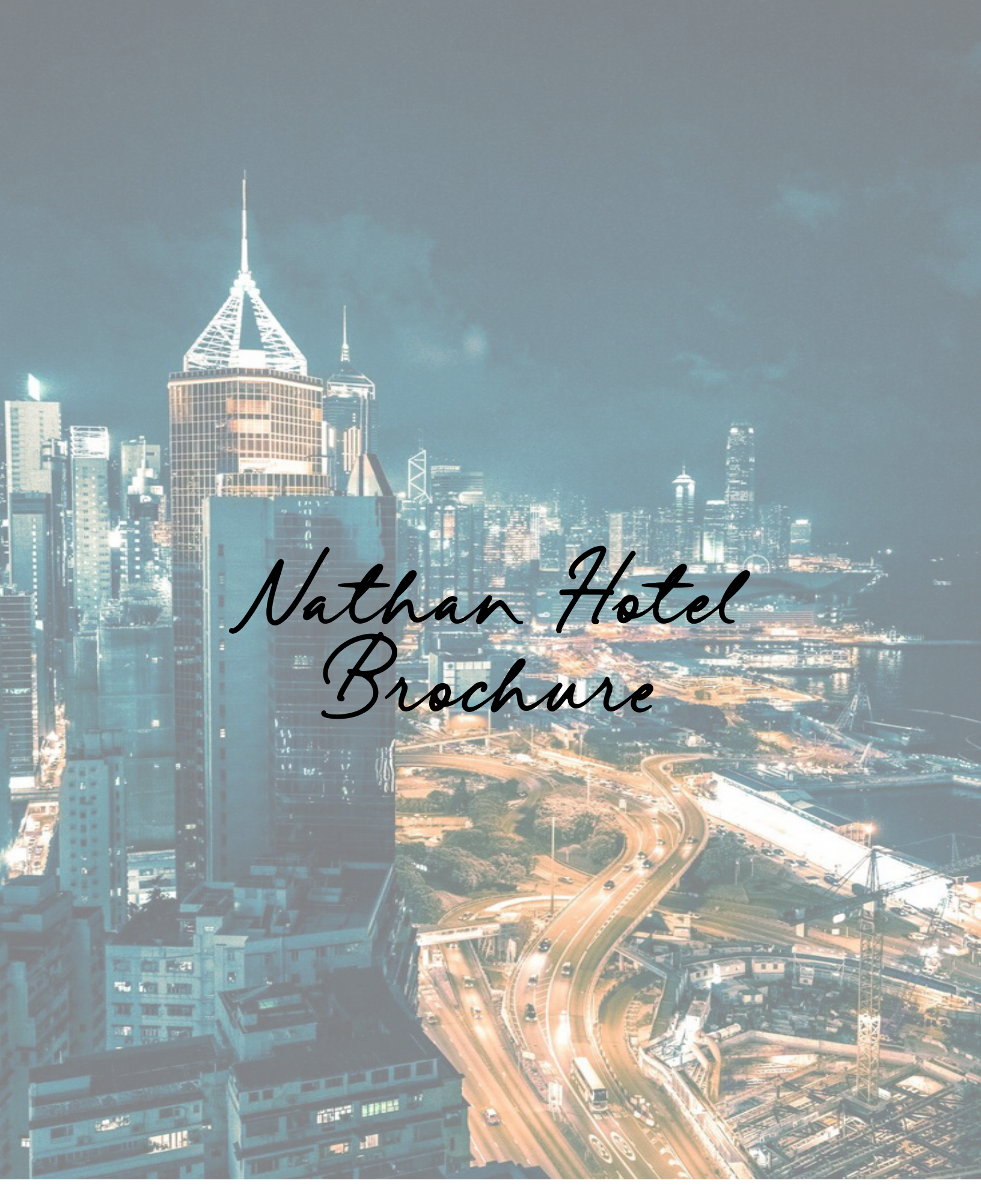
378 Nathan Road, Kowloon